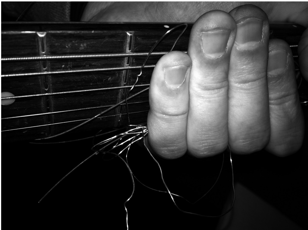
A new way of playing guitar I came up with.

Late in October, on the 31 st I performed some ambient noises and set up music for the intervals at a combined suspension and croquis night at Frank in Malmö. It was a special evening, people hanging from meat hooks and a cosy atmosphere. A good concept overall. Played some table of Things, and some guitar noise at the end. The guitar noise worked great with the intense, excited atmosphere the last person to hang gave off. Realised I should make an album with guitar noise, it's time (so that's something more for 2017).