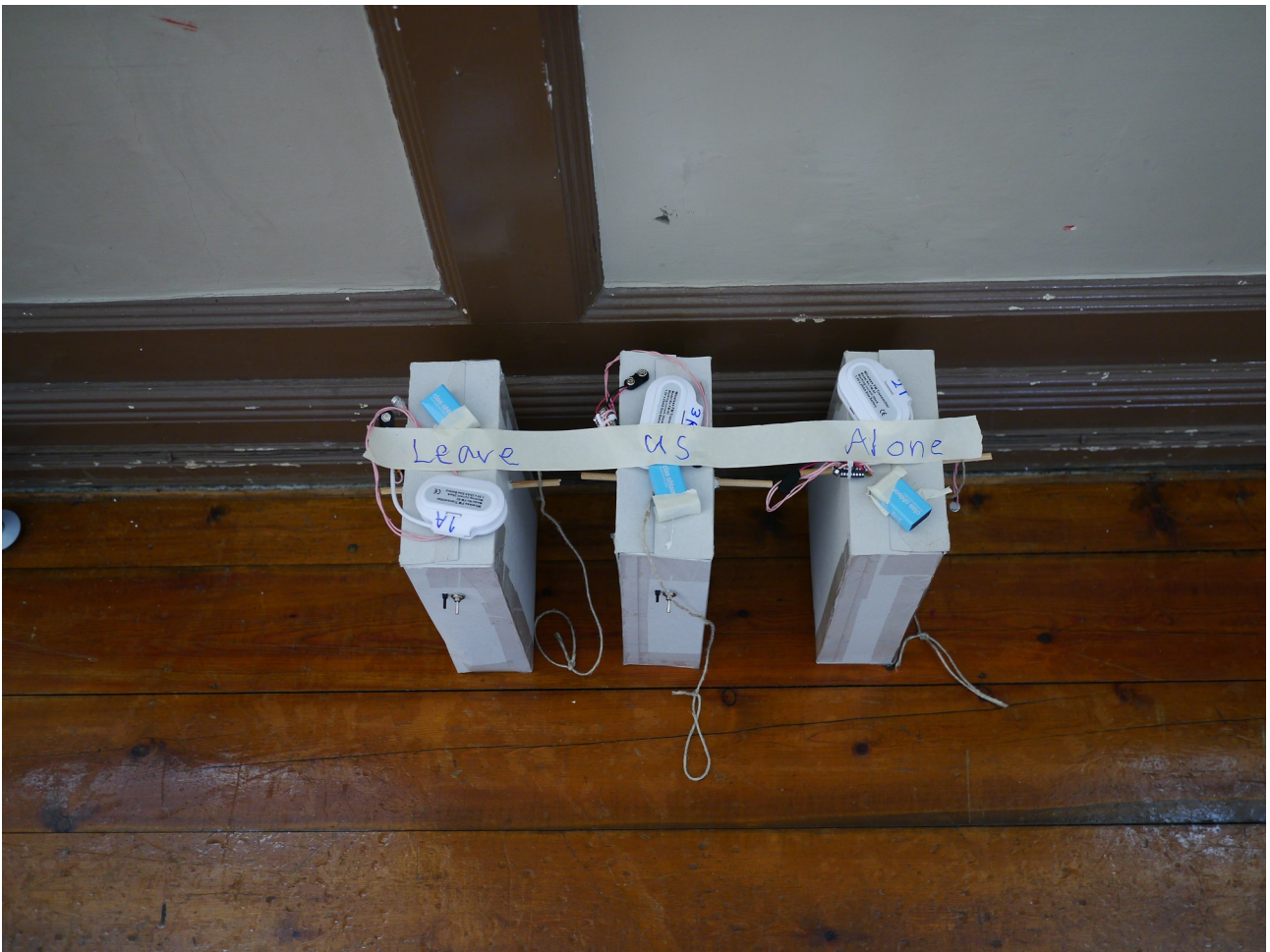
Boxes, pre-gig in Aarhus.

After that, (on the 14 th of May) I went to Aarhus, Denmark, to again perform Radio 1 with asamisimasa, at the SPOR festival. Again, we did it with my newest de-controlled amplifiers, which I'd worked on a bit more since April. Here they are waiting backstage: