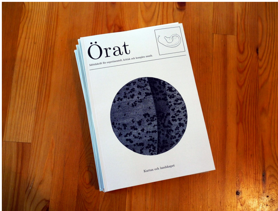
Örat means "the ear".