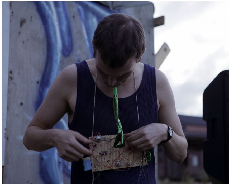
Sound check with the Celebration of Badness.

Video with sounds from the sound check and performance: https://vimeo.com/192134188